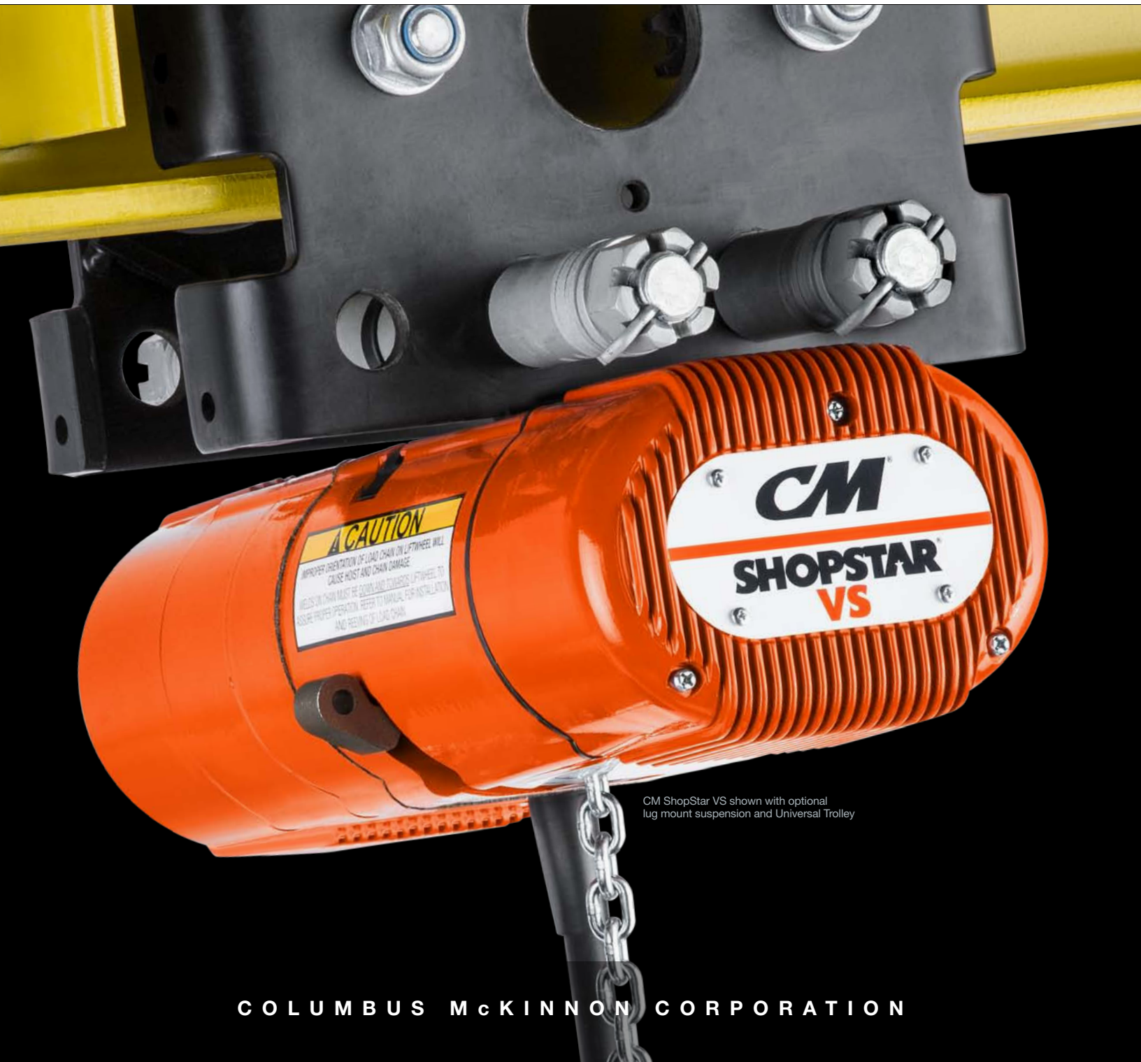
CM ShopStar VS shown with optional lug mount suspension and Universal Trolley

C O L U M B U S M C K I N N O N C O R P O R A T I O N