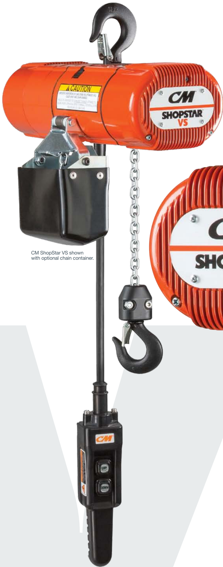
CM ShopStar VS shown with optional chain container.